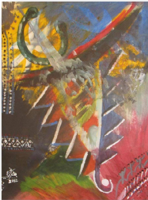
Tawlaft n uyamus: Najim BELGHARBI ጌገገገ ግግግግግግግግ